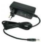
DC12V/1.5A Power Supply